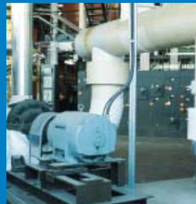
Long Distance Transmitter A733