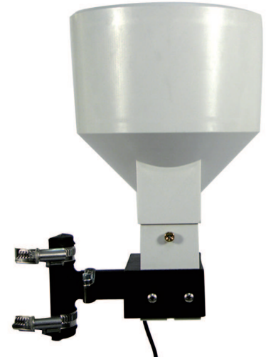
Rain Gauge, 0,2mm, 200cm 2