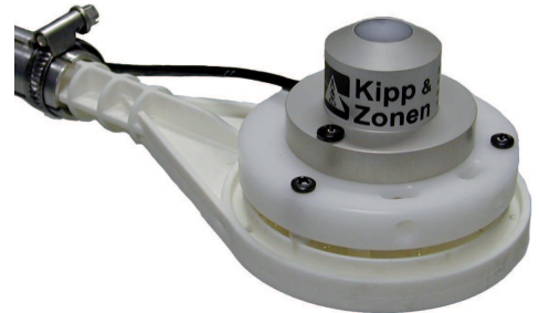
Pyranometer SP-Lite with mast mounting arm